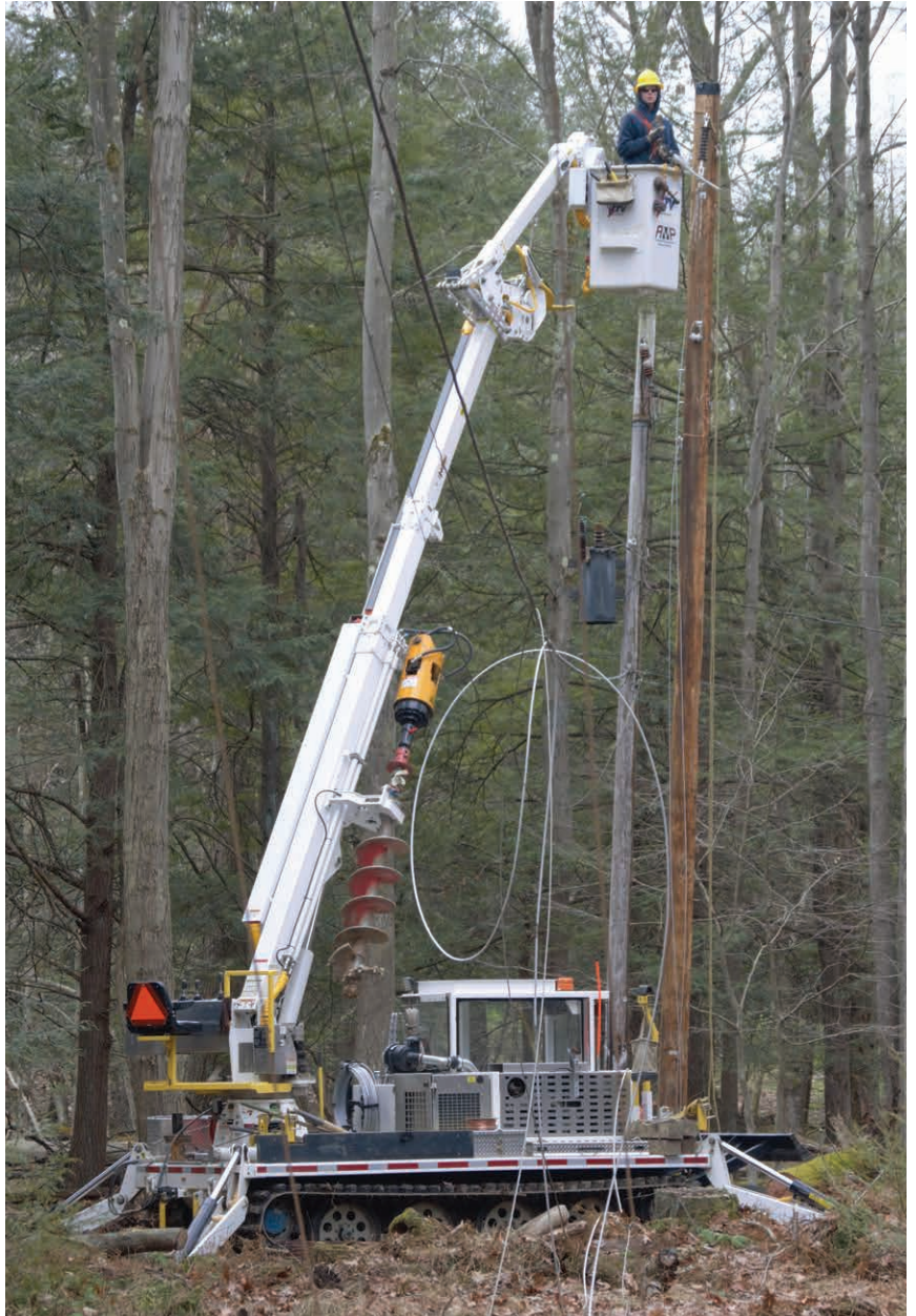
EASY ACCESS: Somerset REC Lineman Carter Engleka uses a track machine to access lines in hard-to-reach areas in the right of way at Indian Lake Borough, where the cooperative is undertaking system upgrades.

noticed the electrical load in the Indian Lake area had increased, and the time had come to begin upgrading those facilities. Members were converting to on-demand water heaters and electric heating systems,